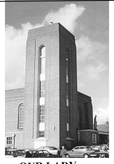
OUR LADY, QUEEN OF APOSTLES